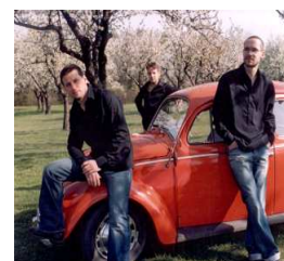
TRIO 75 piano trio