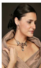
EDITA ADLEROVÁ mezzo-soprano