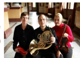
BRAHMS TRIO PRAGUE french horn, violin, piano