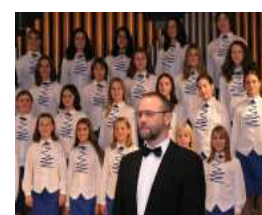
THE CHILDREN'S CHOIR OF ŠUMPERK – BUTTERFLIES ŠUMPERK