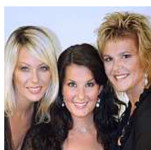
TRIO SIRAEELS viola, piano, soprano