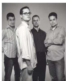
EPOQUE QUARTET string quartet