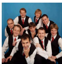
GENTLEMEN SINGERS vocal ensemble